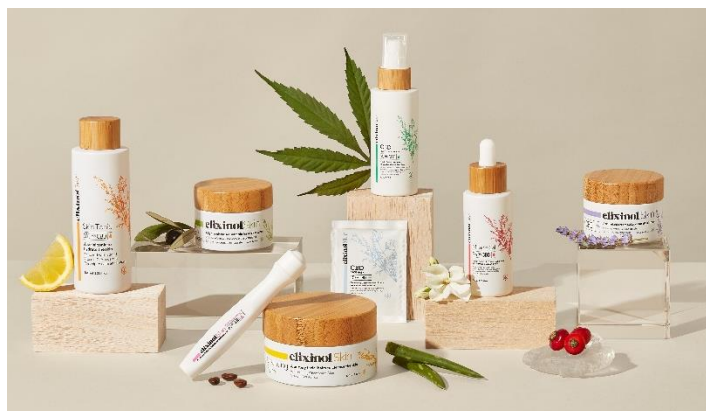
Boots elixinolSkin range

Further new growth channels came on stream, including via a listing with Well Pharmacy, the UK's third largest pharmacy chain with 760 stores and with Boots Ireland, with whom Elixinol launched the elixinolSkin CBD skincare range product as first-to-market partner.